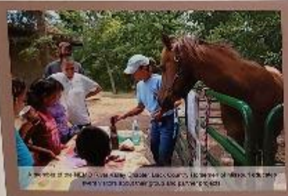
A group of the NEMO River Valley Chapter, Back Country Horsemen of Missouri, and the Corps staff at the Mark Twain Lake Visitor and Educational Resource Center.