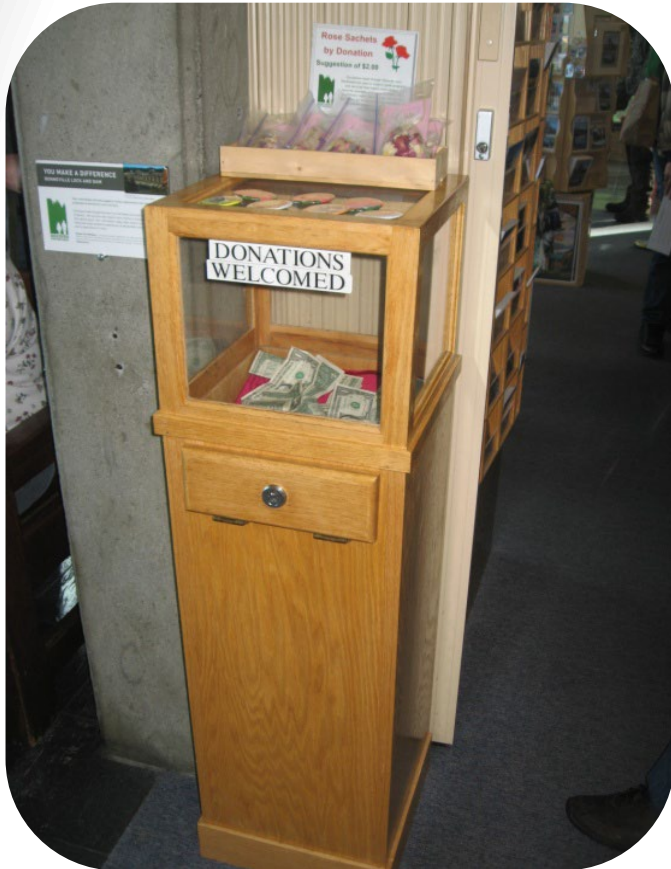
Bonneville Visitor Center