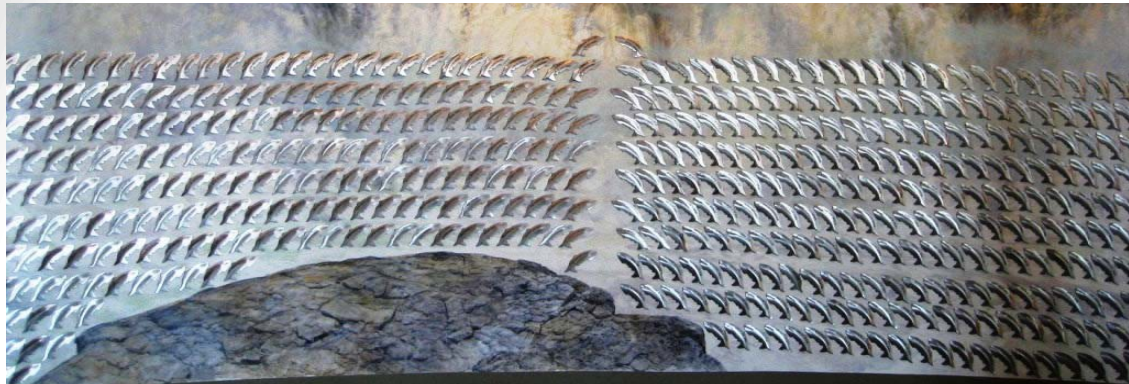
Donor board at the Tillamook Cultural Institute, Tillamook, Oregon

For contributions valued at $XX (TBD by manager) or above, a donor board or wall located and integrated into the project office, visitor center, or other appropriate visitor facility may be used to recognize the donation.