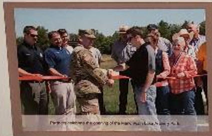
Partners and Corps staff at the Mark Twain Lake, Missouri, U.S.