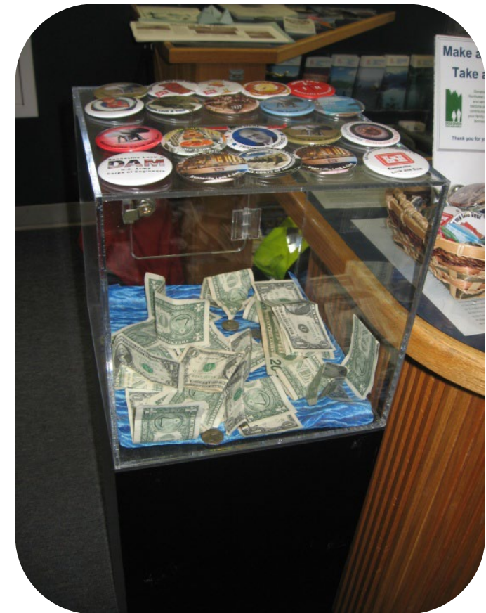
Bonneville Visitor Center